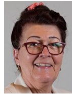
Dawn Hall Nyetimber