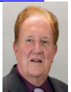
Leonard Brown Orchard